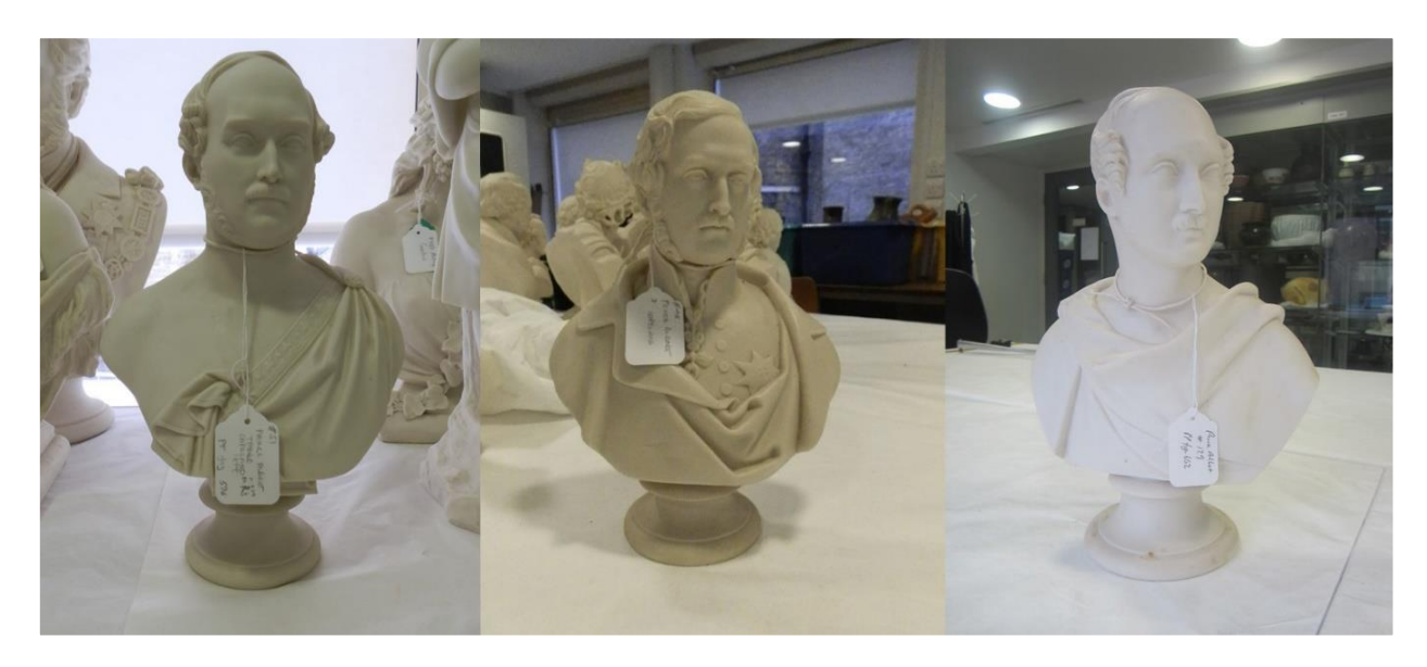
3 different busts, all representing Prince Albert, the husband of Queen Victoria