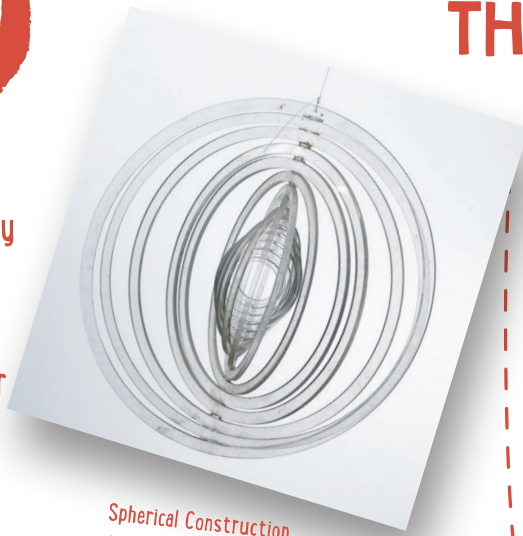
Spherical Construction by Gregorio Vardanega

Kettle's Yard is a house and a gallery full of art and objects that catch the light and create different shadows and reflections. Make your own hanging mobile inspired by artist Gregorio Vardanega to see what shadows it creates.