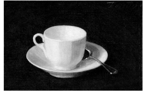
White cup and saucer by Henri Fentin-Latour (1864). Gallery 5.